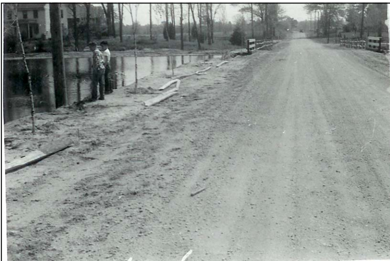
Jackson Road as viewed from North Lakeside Dr looking south toward Tuckerton Road. This picture was taken in the 1950s before Jackson Road was paved. Notice the two houses on South Lakeside Drive East built before Jackson Road was paved.