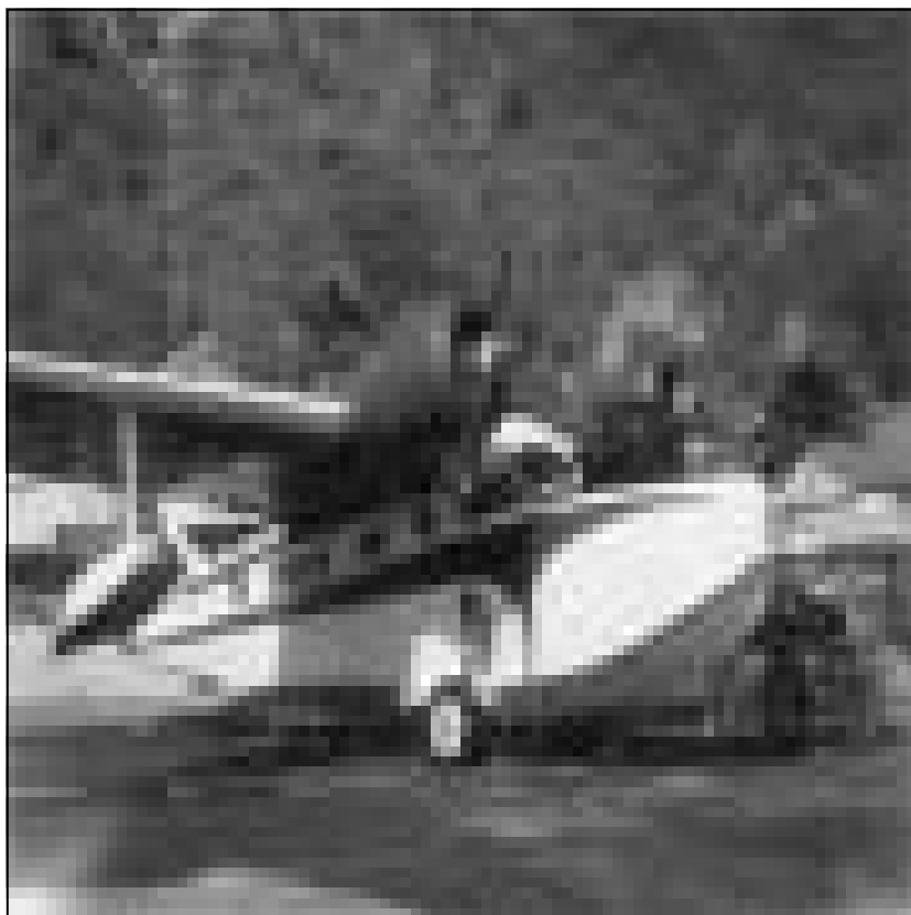
Blue Sky's Grumman Goose taxis onto the Colony Club beach in this May 2004 photograph. Notice Colony Club members in the background helping unload baggage.

The service would consist of a 7 am flight to Philadelphia airport and an 8:30 am flight to Newark. There is planned a 4:30 pm flight from Philadelphia airport and 6 pm flight from Newark airport. These flights would mean Birchwood and our neighbors would no longer face a one hour drive with a bridge toll of $3.00 and parking fees of $9.00 per day to get to Philadelphia airport. The Blue Sky shuttle would take only 90 minutes and cost only $145.00. Customers would be encouraged to leave their cars in the Colony Club parking lot as the seaplane would taxi up and onto our beach for boarding and deplaning.